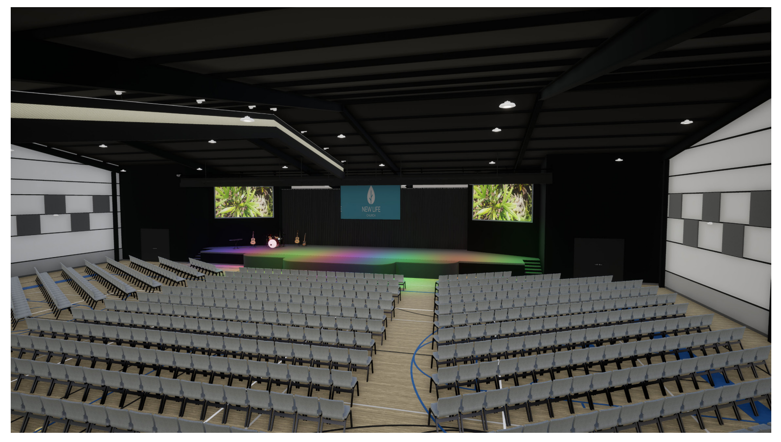
Above: Auditorium set up for a Sunday morning service. You can see the stage will come out into the room to give depth to the area. The auditorium will accomodate over 750 seats for a Sunday morning service. This space will also be a primary meeting place for Teen Life on Sunday nights.